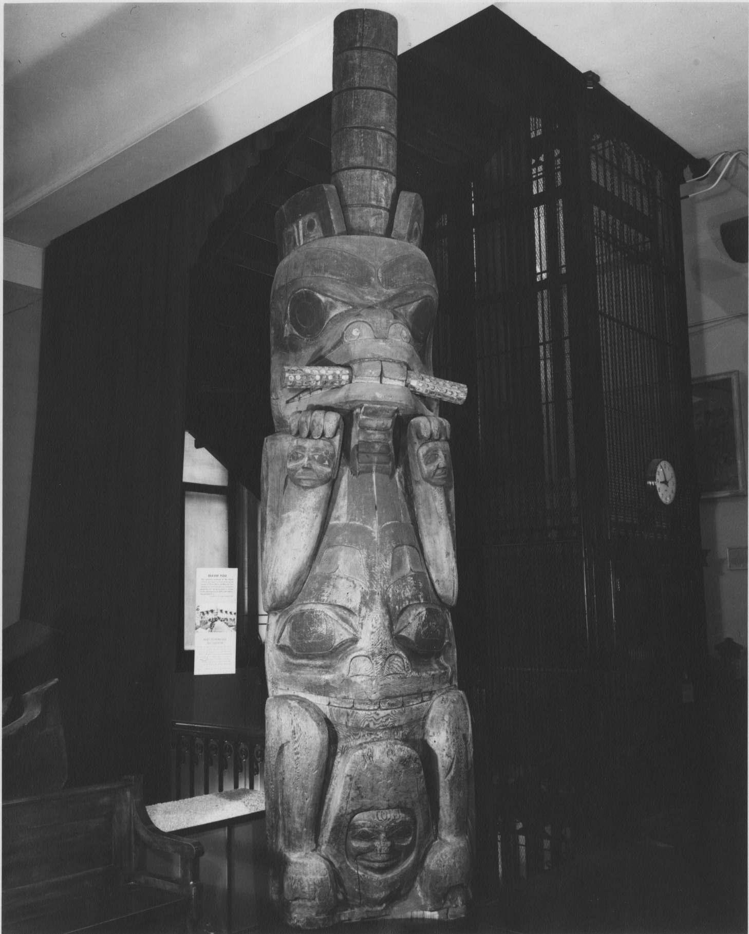
WILLOW POLE This pole was carved by a Tahltan Indian of the Klaskanine River, British Columbia, and is now in the collection of the British Museum, London. The figures represent the spirit of the pole, the spirit of the river, and the spirit of the forest.